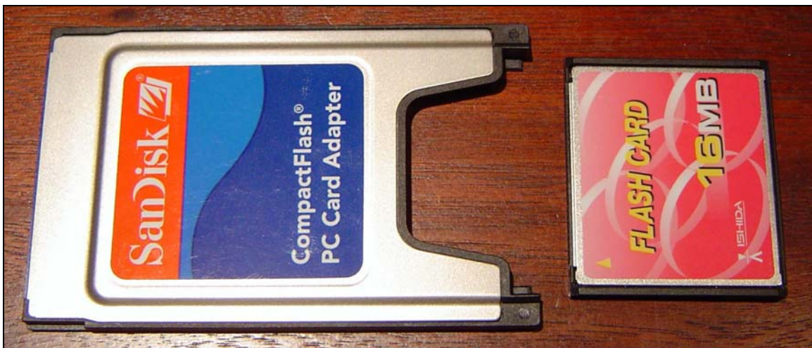
Figure 2. PCMCIA Card Adapter and Compact Flash (CF) Memory Card