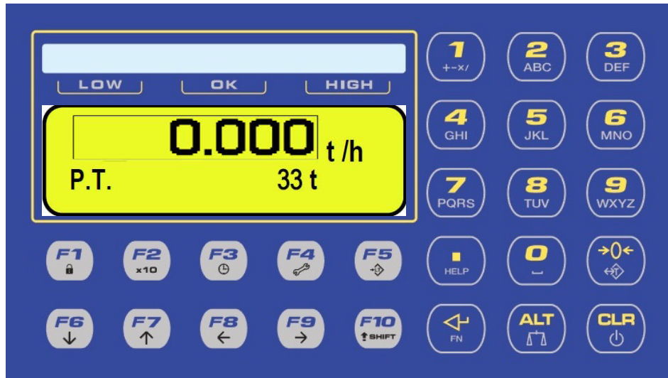
Figure 2-1. Front Panel Display