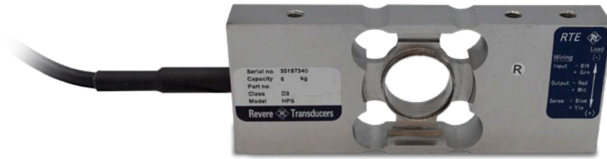
Picture is a representation of actual product